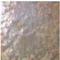
Glaze Combination 13 50% PG813 Michigan Patina 50% PG816 Flame Blue