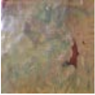
Glaze Combination 10 50% PG816 Flame Blue 50% PG808 Beetle Juice