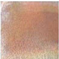
Glaze Combination 14 50% PG808 Beetle Juice 50% PG802 Copper Flash