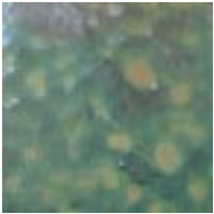
Glaze Combination 11 75% PG808 Beetle Juice 25% PG816 Flame Blue