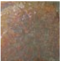
Glaze Combination 12 50% PG816 Flame Blue 50% PG811 Blue Dolphin