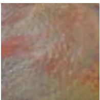
Glaze Combination 16 50% PG801 Apple Crackle 50% PG811 Blue Dolphin

Screw the plate toward the burner to restrict air flow into the burner. This creates a fuel-air mixture richer in fuel, so less oxygen is sucked into the kiln. If you screw the plate down too far, you will starve the burner and extinguish the flame.