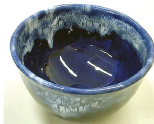
IN1075 Cobalt Blue with SC16

Small Crystals: Mix the crystals from the bottom of the jar into the glaze for all 3 coats. Do not let crystals collect toward the bottom of the jar.