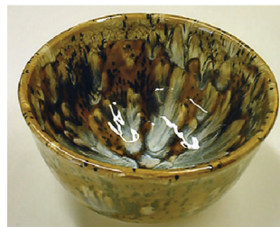
CR904 (discontinued) with SC16

Firing - Let the glazes dry. Stilt and fire to witness cone 06 .