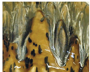
Inside of bowl detail