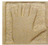
CC509 • Pioneer Dark

The color difference in clays affects your glaze results.