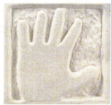
CC520 • G-Mix 6

The samples on this flyer are shaped like taco shells: flat clay rounds incised or stamped with texture, then folded in half for glazing and firing. The class students chose all their own patterns and designs, so no two are quite the same. Clay color interacts with and changes glaze color results. Unless otherwise noted, all the "tacos" were made from our G-Mix 6 clay. We had originally planned to use these images in our catalog but ran out of space. Instead, we are presenting them on our website and as a companion to the "Combo Mambo" flyer.