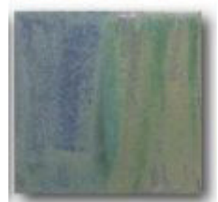
PG616 Buckwheat under GLW42 Blueberry & GLW08 Copper Patina

As you can see, this is just a beginning of the possible combinations and possible firing schedules; although I will stay with these two for a while longer. In my tests I was working with a safety net ... trying to stay within a known set of glazes that were well behaved, not having a tendency to run on a vertical surface (with the exception of GLW03 Avocado Ice).