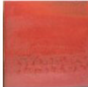
GLW34 Ohata Fired Alternate #2 schedule

I'll leave you with this direct comparison of our Ohata glaze. Firing truly has a significant impact on the results one can achieve and expect.