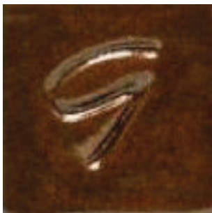
GLW34 Ohata Fired to ^6 medium speed with no hold

I live with the mantra taught to me by Pat Horsley: "Everything Matters and Nothing is the Same". So with any testing that you do, the clay you use, your glaze application/thickness and the firing schedule - it all matters. Be sure to protect your kiln and shelves and expect to be surprised.