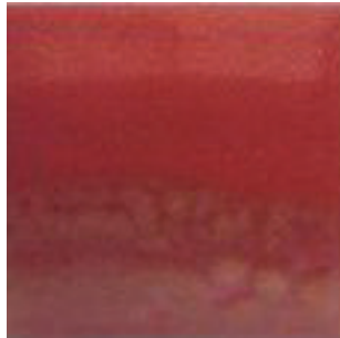
GLW34 Ohata Fired Alternate #1 schedule