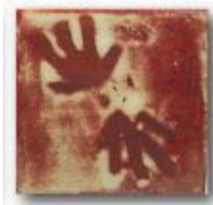
GLW22 Rusty Nails under waxed design GLW32 Latte