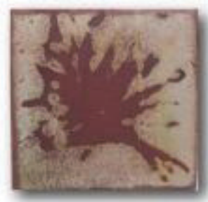
GLW22 Rusty Nails under waxed design GLW36 NW Woods