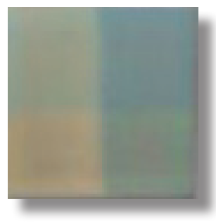
PG631/PG642 Gold Dust and Blizzard Blue