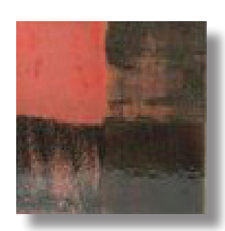
GLW34/GLW45 Ohata with Plum Black