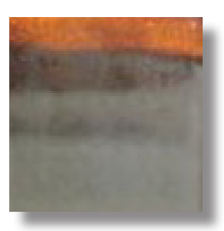
GLW04 Liquid Luster Bronze - No real change