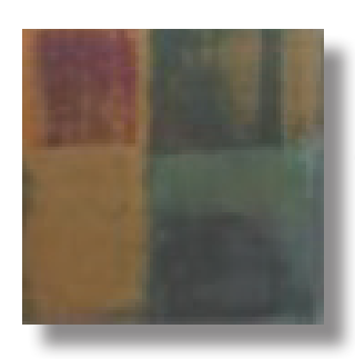
GLW26/GLW47 Mustard Wood Ash and Kalamata Black