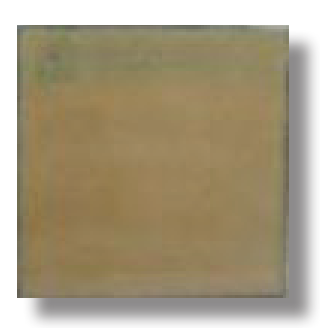
GLW46 Northern Lights - Overall color khaki gold