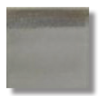
PG616 Buckwheat - Mottles to grey blue/white