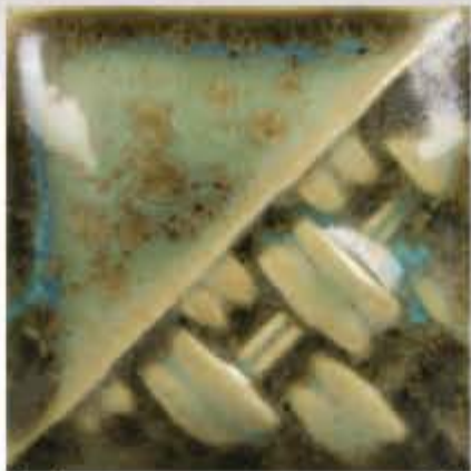
CL SW216 Micro Jade