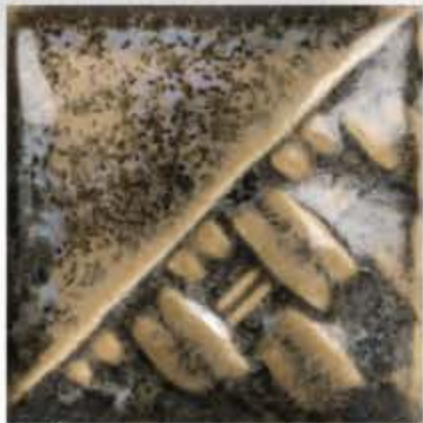
CL SW218 Micro Ash