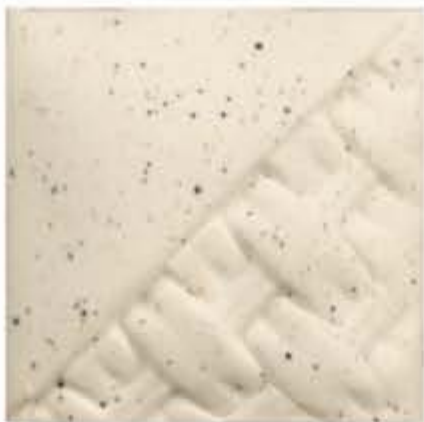
AP EG002 Speckled Buff Engobe