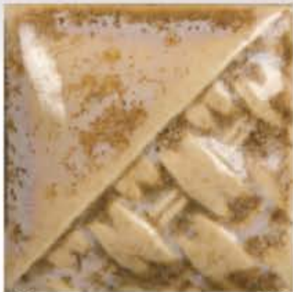
CL SW215 Micro Champagne