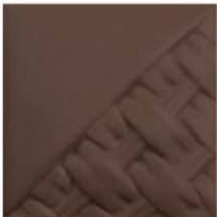
AP EG003 Brick Red Engobe