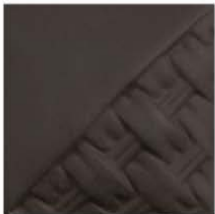
AP EG004 Dark Brown Engobe