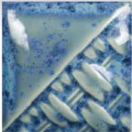
CL SW217 Micro Cerulean