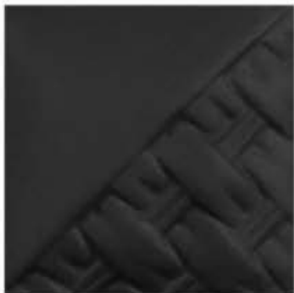
AP EG005 Black Engobe