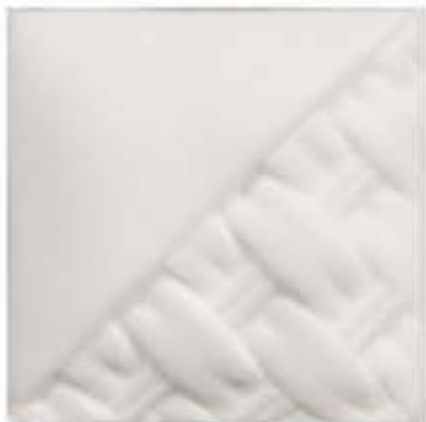
AP EG001 White Engobe