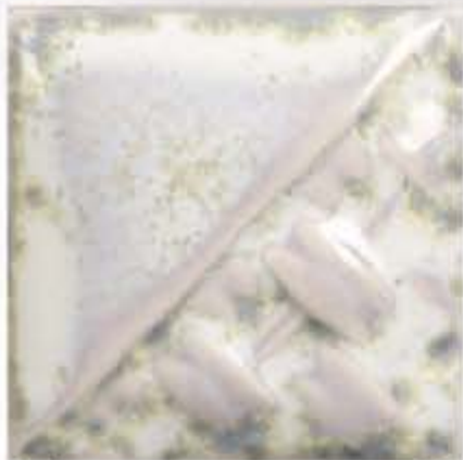
CL SW214 Micro Pearl