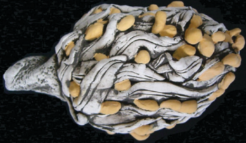
"Fussy Glazing" as Christy calls it ... begins with the fine details. Choose the small areas and apply 2-3 coats.