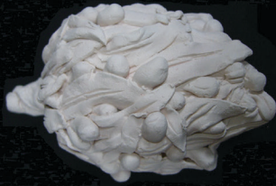
Begin on ^04 bisque.

Our test clay is Georgies CC520 G Mix 6; a light, off-white clay body with a fine tight texture...except where noted. We bisque to ^04 and glaze fire to ^6 on medium speed - no hold.