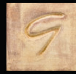
GLW31 Dry Rust