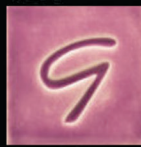
PG639 Hot Orchid