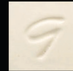
GLW37 Pure White Matte