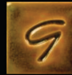
PG651 Mottled Brown