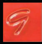
PG647 Burnt Orange