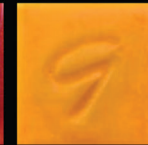
GLW55 Turmeric Matte