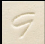
GLW23 White Froth