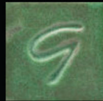
GLW08 Copper Patina