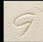
GLW15 Jujube White