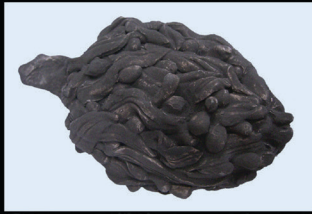
Brush 1 coat of your choice of Interactive Pigment over the entire piece.