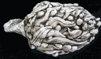
With a clean sponge and water, wipe back to your desired level to show & enhance your detail.