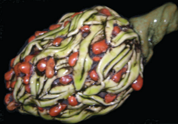
The finished piece ...

PG647 Burnt Orange Berries PG652 Chartreuse Gloss PG653 Golden Green IP202 Tree Bark