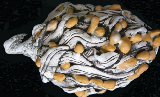
Wax Resist - apply wax resist to your glazed areas. Premium resist is great.