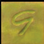
GLW56 Chartreuse Matte