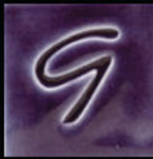
PG638 Blue Violet