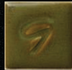
PG653 Golden Green