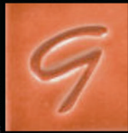
PG621 Wonder Red