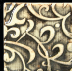
IP202 Tree Bark