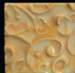
IP203 Golden Straw