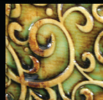
IP205 Autumn Foliage