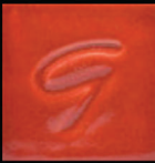
PG624 Ripe Apple Red