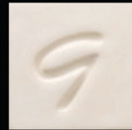
GLW12 Eggshell Wash