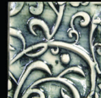
IP207 Steel Black