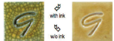
GLW53 Yangtze Amber Crackle