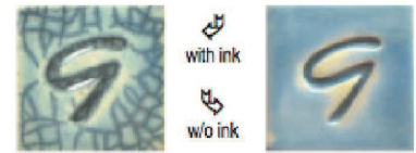
GLW51 Wu Blue Crackle