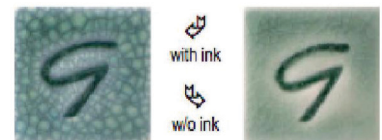
GLW50 Dragon Scale Crackle