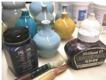
Ink from an Art Supply Store ...

Fired bottles ready to be "inked". You will need your fired piece (crackle must be evident), brushes (calligraphy), india or sumi ink, paper towels (several!), water, and disposable gloves.